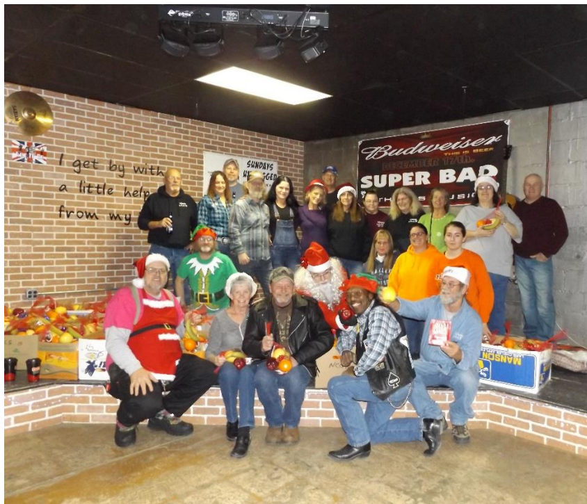
2016 Santa's Elves for fruit basket assembly!